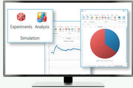
Picture: The Simanalyser module enables the assessment and visualisation of results data.

Input data: For valid simulation results, a large number of input parameters (speeds, cycle times, job data, etc.) must usually be entered. These can be entered either directly in the simulation components or centrally in table structures. If required, data can also be read at runtime from databases, for which an ODBC interface is available, for example.