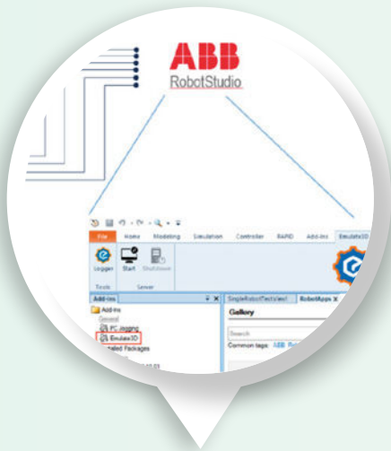
Picture: Sim3D enables the connection of robot simulators

For robots, it is also possible to have the axis positions controlled by a connected robot simulator or control emulator to simulate real trajectory. Standard interfaces to Fanuc Roboguide, Omron ACE, ABB Robotstudio and Yaskawa MotoSim are available for this purpose.