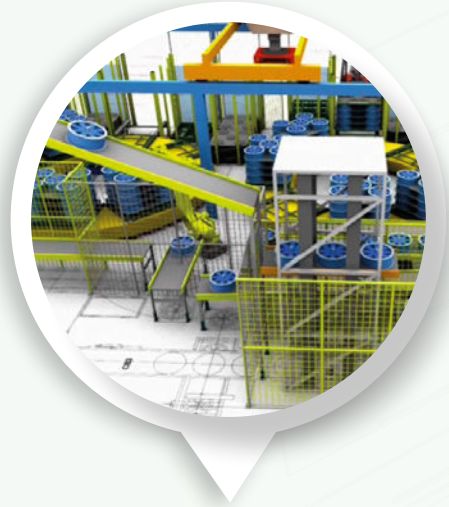
Picture: Simulation model of a tyre assembly, -sorting and buffering system

MagneMover® is an intelligent and cost-effective conveyor system from Rockwell Automation, designed to move light loads quickly and efficiently. For the simulation of these systems, Sim3D provides a catalog that allows systems to be quickly modelled and simulated.